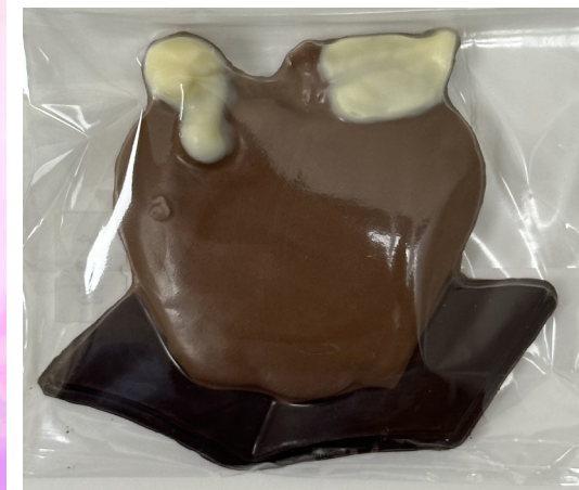
Apple w. bookworm $3.50