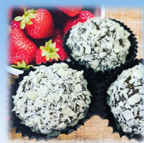
Seasonal Flavor: Strawberry Rhubarb

Most of our truffles and clusters are gluten free. Please ask us for assistance if there are any allergy concerns.