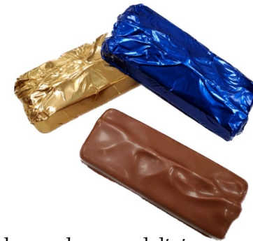
Peanut butter bars — delicious creamy peanut butter filling. Available in milk (gold) and dark (blue) chocolate. $2.20