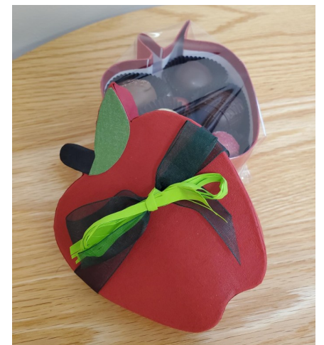
Apple shaped truffle box $17.95