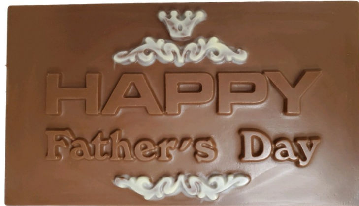
Large Happy Father's Day Bar—$11.95