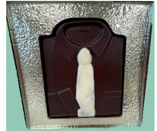
Chocolate shirt in a box—$17.95