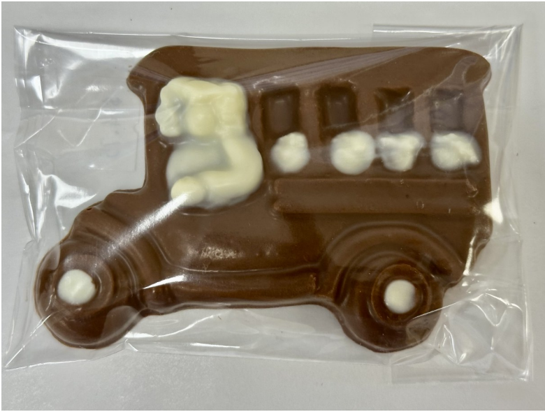
School Bus $4.75