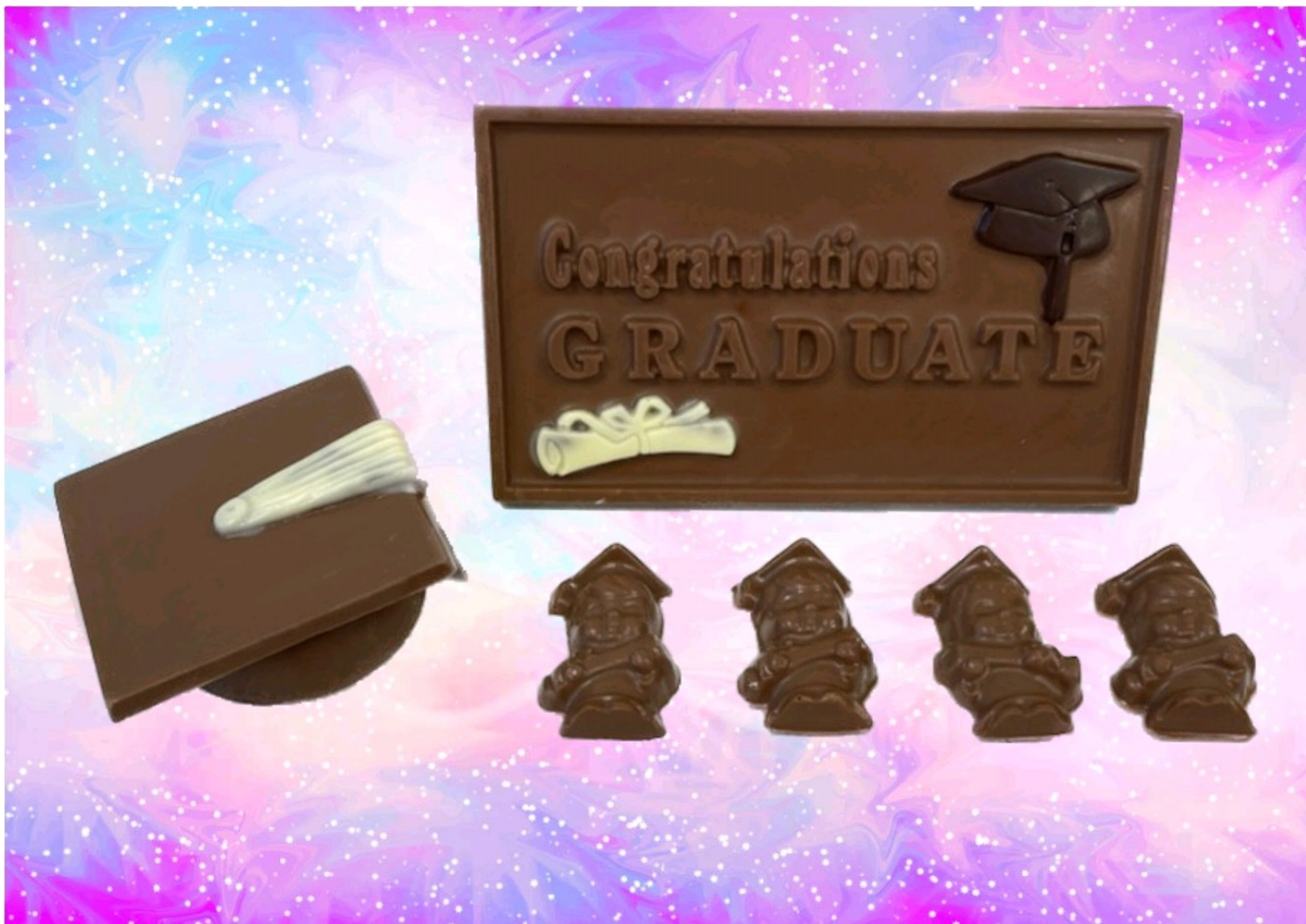
Congratulations Graduate Bar—$11.95 Graduation Hat $10.95 Graduation Shapes in 100g bag (9.50)