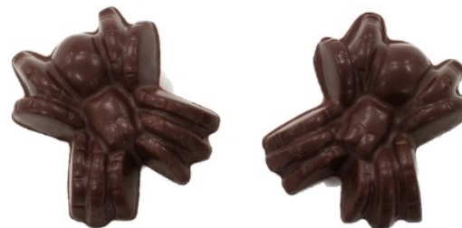
Spiders—2 per bag

Available in milk, dark and white chocolate.