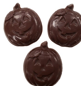
Pumpkins— 100g bags

Available in milk, dark and white chocolate.